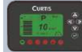
CURTIS big LED dashboard. Non-handset Operation