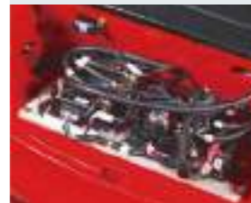
Imported high performance, and new generation AC controller