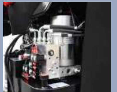
BUCHER hydraulic unit