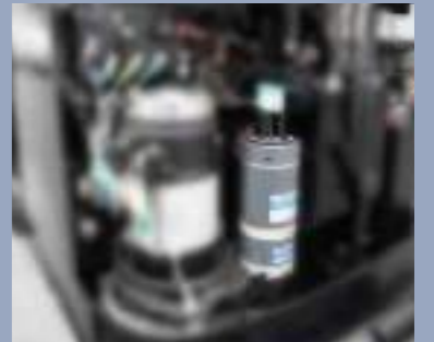
EPS (Electric Power Steering) is standard specification