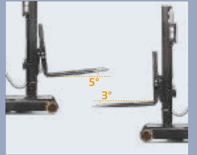
Fork tilt F/R: 3° / 5°