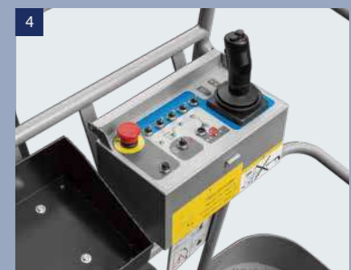
Basket control box: each action of the device can be controlled through the control box to quickly reach the working area, and the control is simple and easy to understand