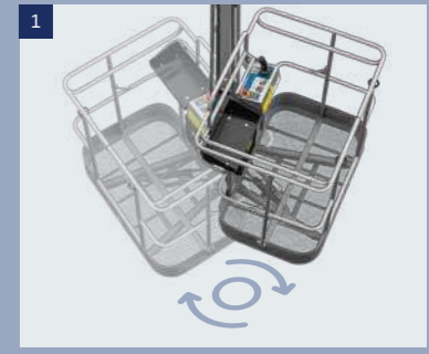
Basket: can be rotated left and right at an Angle of 140°