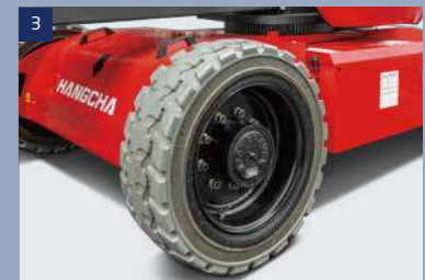
Tires: foam-filled tires with good off-road performance