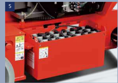
Standard tracking battery: Reduce 40% of the charge time, raise 50% of the life time