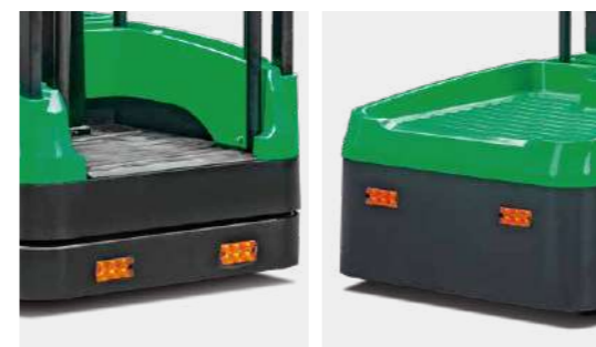
Front and rear flashing lights