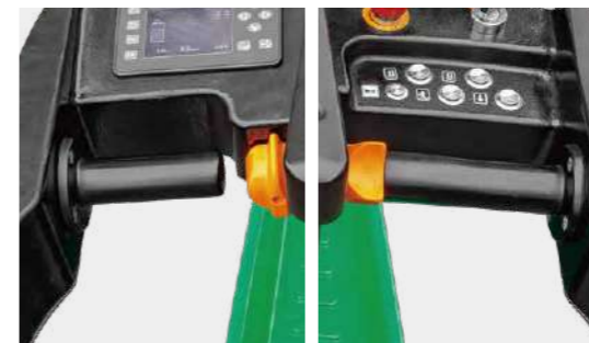
Right and left hand sensing